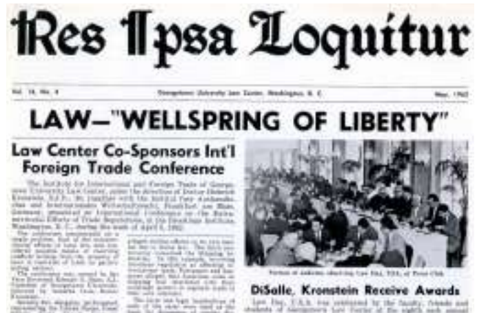
May 1962 issue of Res Ipsa Loquitur .

The Library is grateful to the Friends for helping us with these important projects.