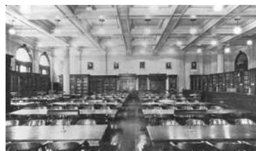
Georgetown Law School in the 1950s